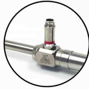
STORZ COMPATIBLE LIGHT PORT