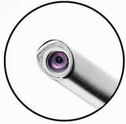
ANTI REFLECTION WIDE VIEW LENS