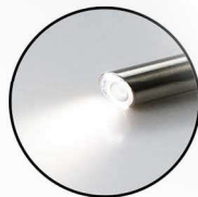
HIGH LIGHT TRANSMISSION